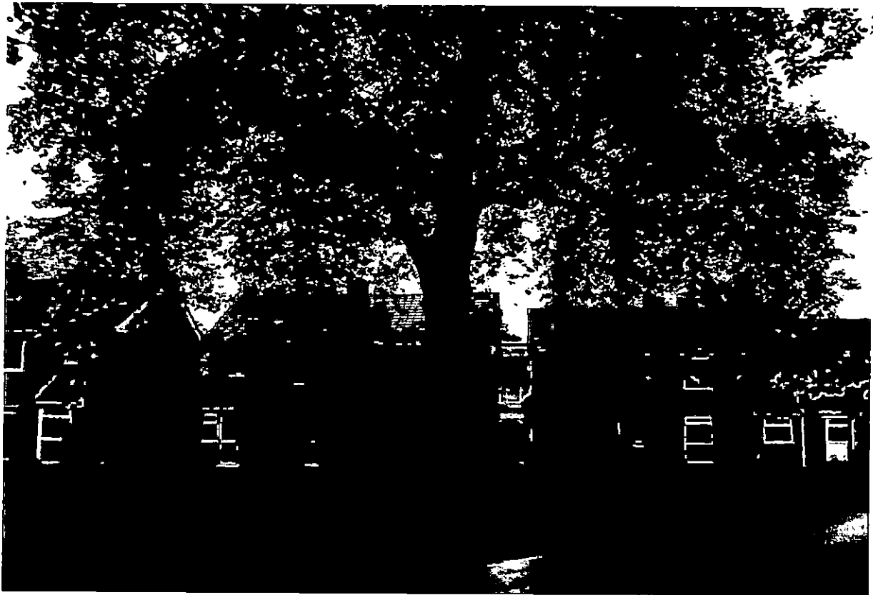
Photo two. T41 Horse chestnut showing approximate line of pruning